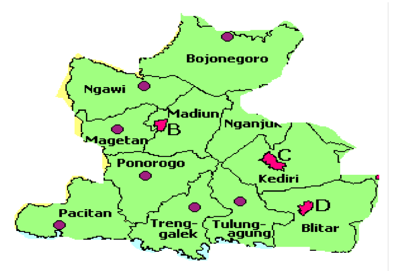
Fig. 1. Study Area - Potential Plants Developed With Agroforestry System

The research was conducted in the community forest of Madiun residency ; data collection was carried out in the month of October – November 2021.